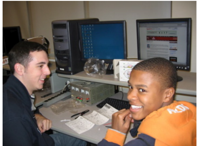
Fig. 4. Penn undergraduate students working with high-school students on one of three robotics projects completed over ten-two hour sessions.

assignments for another midterm and final exam.) For the assignments that both groups completed in common, we were able to carry out a direct comparison of their performance. As shown in table II, students in the two groups performed