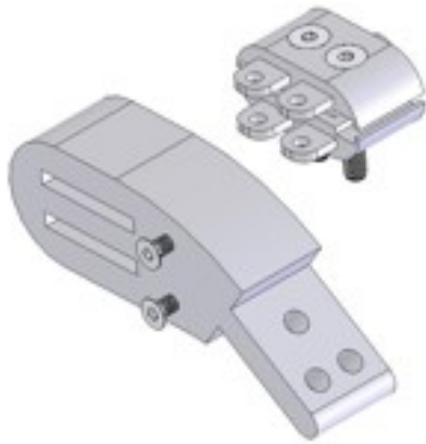
Fig. 2. Edubot: A modular hexapedal robot, Edubot provides students with the opportunity to explore ideas from a wide range of fields including, math, biology, systems and electrical engineering, mechanical engineering etc.

in the literature. This enhances the design of labs aiming to promote an embrace of open-research problems.